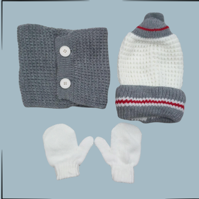
BABY WOOLEN HAT, MITTENS AND NECK WARMER