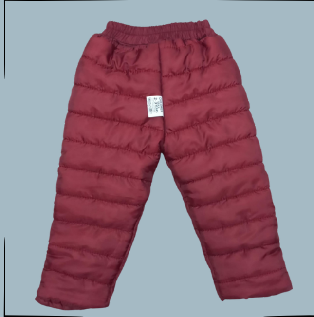
WARM PUFFBALL TROUSERS (UNISEX)