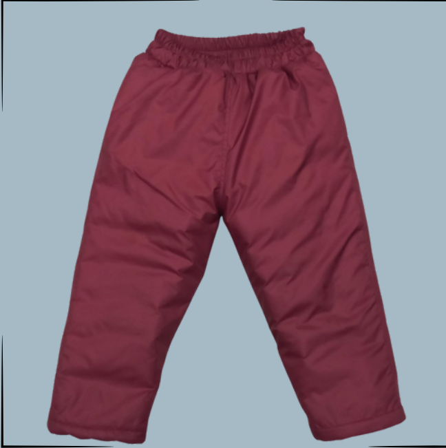
WARM PUFFBALL TROUSERS (UNISEX)