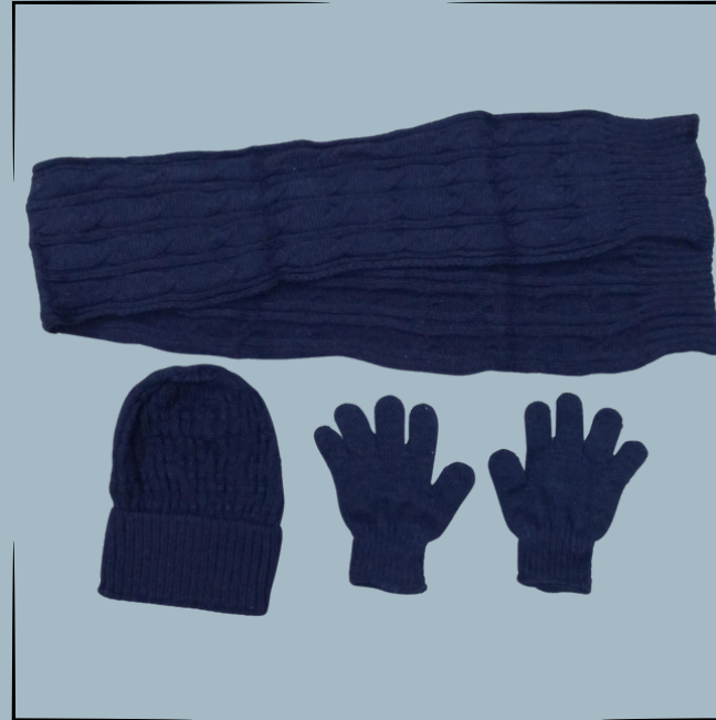
SCARF, BERET, MITTENS