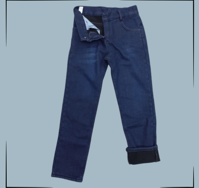
WARM WINTER TROUSERS (UNISEX)